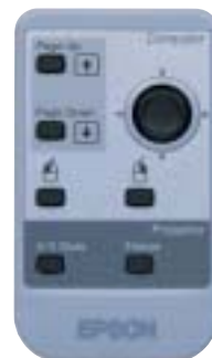
Presentation Remote Control